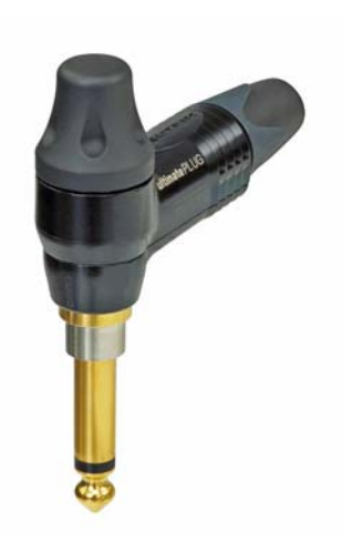
Neutrik ultimatePLUG with 4-step adjustable timbre control knob and silentPLUG.